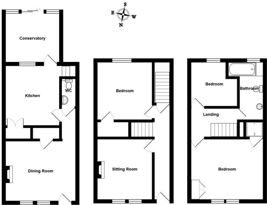
Total Area: 111.6 m 2 ... 1202 ft 2 All measurements are approximate and for display purposes only

Please contact our Charles Wright Properties Office on 01394 446483 if you wish to arrange a viewing appointment for this property or require further information.